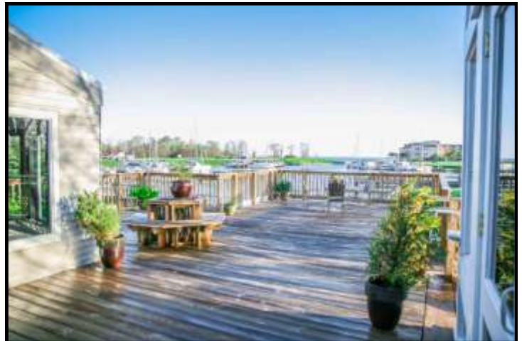
Rear Deck Facing Harbor