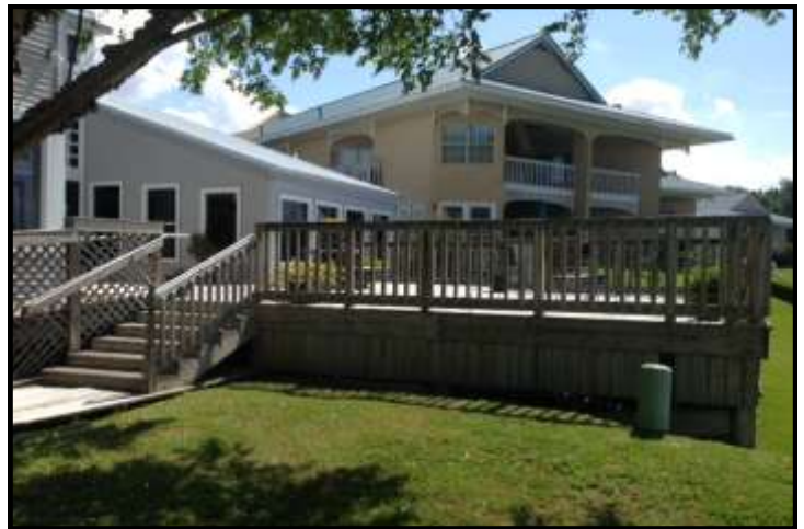
Rear Deck Area