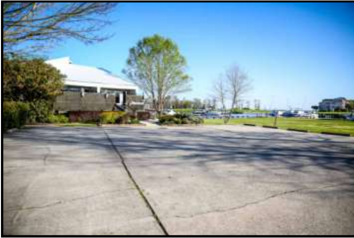
Front Parking & Rear Harbor