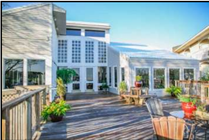
Rear Deck Facing Building