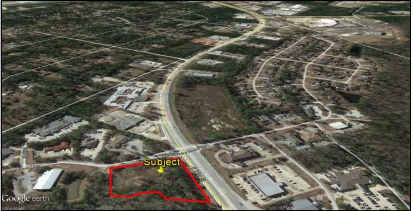
View towards I-12