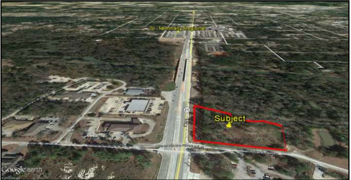
View towards St. Tammany Regional Hospital